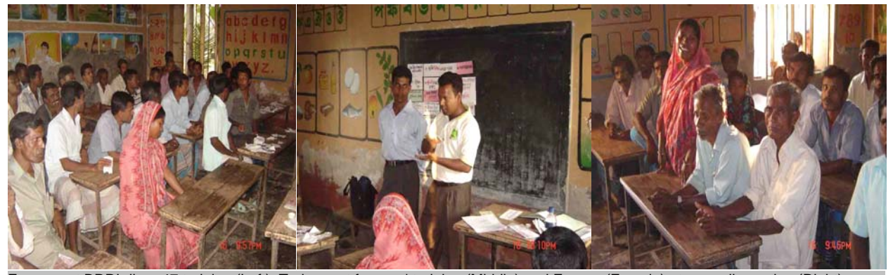
Farmers at BRRI dhan 47 training (Left), Trainers at farmers' training (Middle) and Farmer (Female) at open discussion (Right)

Project staff in collaboration with trained staff and chief executives of the involved member NGOs conducted participatory farmers training on seed production practices of BRRI dhan 41